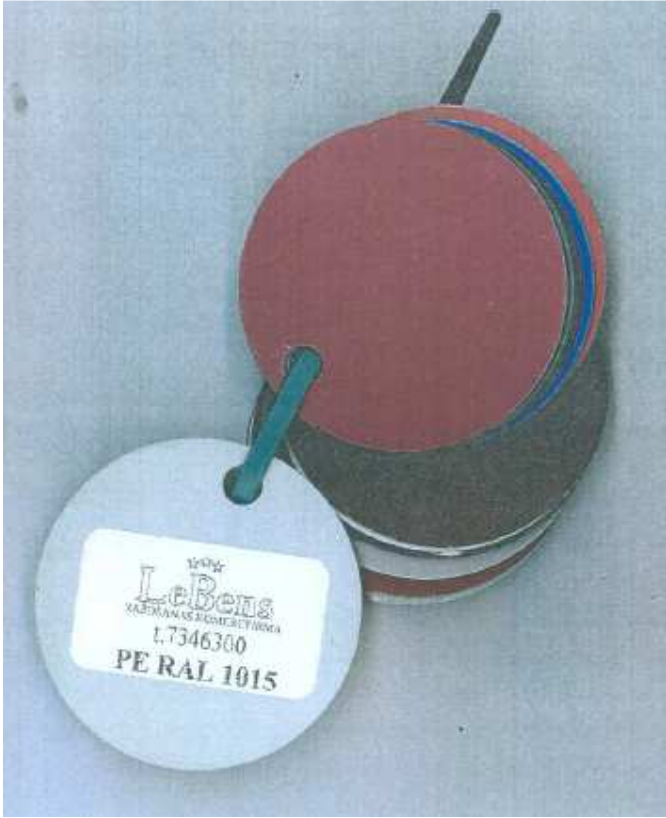
Picture 2. Colour code